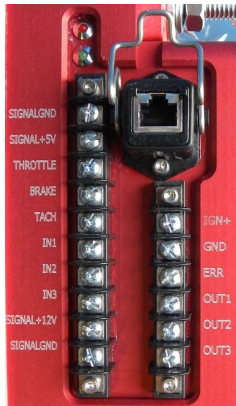
Illustration 1: terminal strips

The only other connections that must be made are for the throttle. The THROTTLE input responds to a 0-5V signal, with 5V considered “full throttle”, and so it is compatible with a wider range of transducers than the older 0-5k input. You can use a potentiometer (pot), Hall effect pedal assembly (HEPA), etc., or any other transducer for a throttle as long as its output voltage is proportional to throttle position (ideally, with a linear response, but logarithmic is fine, too). A stable, protected source of +5V (SIGNAL+5V) is provided on the terminal strip to use either as a reference voltage or to actually