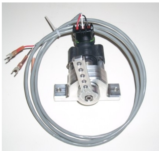
Illustration 2: EVnetics throttle transducer

provide power for the throttle transducer. If using the EVnetics Throttle Transducer (See Illustration 2), or similar high quality pot, simply connect the full throttle end (red wire) to the SIGNAL+5V terminal and the zero throttle end (black/shield wires) to SIGNALGND (to avoid picking up noise, do NOT connect either the pot or this terminal to the vehicle ground) and the wiper (white wire) to THROTTLE. If using a HEPA, connect the +5V terminal to SIGNAL +5V, the output terminal to THROTTLE and the ground terminal to SIGNALGND. If the wiring run between the throttle transducer and the Soliton1 is more than 1m (~3') then consider the use of shielded cable, such as Radio Shack part # 278-0513, and connect the shield to SIGNALGND. WARNING - the popular Curtis PB-6 “pot box” is not compatible with the Soliton1 as-is because it is wired as a variable resistor – you can modify the PB-6 back to a pot or use a pullup resistor between THROTTLE and SIGNAL+5V, but the latter is strongly discouraged! Please refer to Appendix A – Wiring Diagrams for more information.