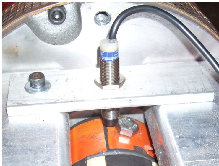
Illustration 3: inductive prox on our dyno

TACHOMETER – this input accepts pulses (amplitude of 4V to 15V) from a wide variety of transducers to read the motor RPM (overspeed protection and idle can't work without it). On our dyno we use a generic industrial inductive proximity (“prox”) sensor with a NPN open collector (OC) output that requires a “pullup” resistor from TACH to