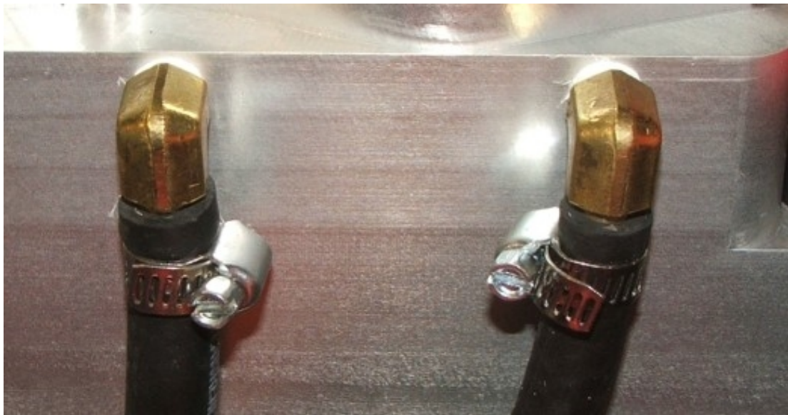
Illustration 4: liquid cooling connections

Liquid cooling is built-in to the heatsink and can be a real benefit in keeping the Soliton1 out of thermal limiting, especially in hotter climates (like where we are, St. Petersburg, FL!) and/or where higher average power is demanded of the controller (such as heavier conversions or in hilly terrain). We strongly recommend that a 50/50 mix of aluminum-safe coolant and water be used to protect against corrosion. Only 1-2 GPM (4-7 LPM) of flow rate is needed and the system pressure should not exceed 5 PSI so impeller (centrifugal) pumps as used for bilges, computer cooling systems, etc., are ideal. The cooling loop should either have a sump with air-gap or a Tee fitting at the highest point in the system to eliminate trapped air. The barbed fittings that come with the controller are for 1/4" ID hose but if you want to replace the fittings ports are tapped 1/8"-27 NPT. Notice the use of hose clamps in Illustration 4 - do not rely on the barbs alone to hold the hose in place!